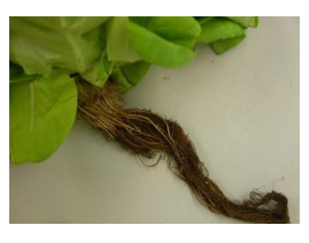
Figure 1: Brown, rotting roots are a symptom of Pythium infection.